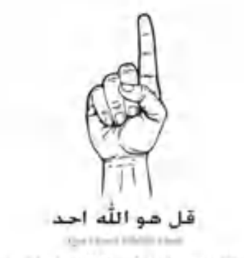
Say: He is Allah, the One and Only